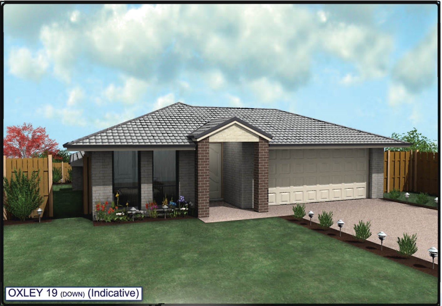
OXLEY 19 (DOWN) (Indicative)