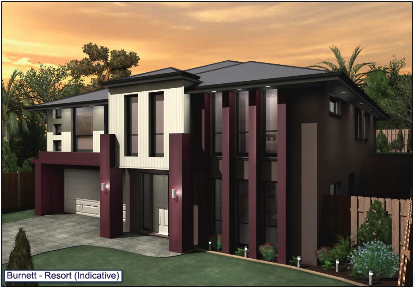
Burnett - Resort (Indicative)