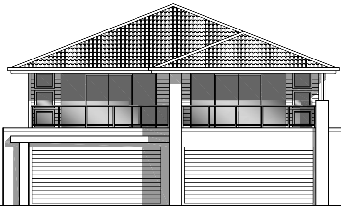
FRONT ELEVATION 11990